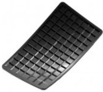
Silicone iron rest included